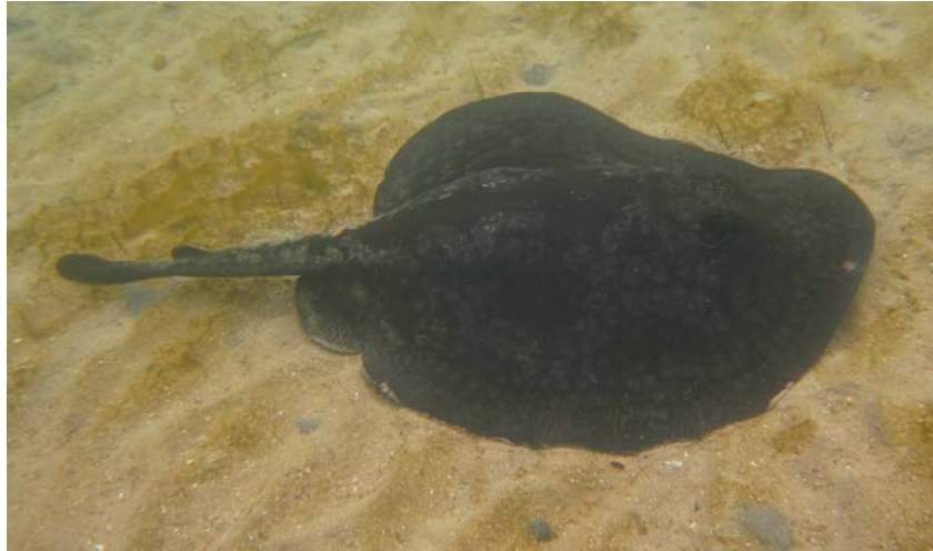
Eagle Ray, Myliobatus australis